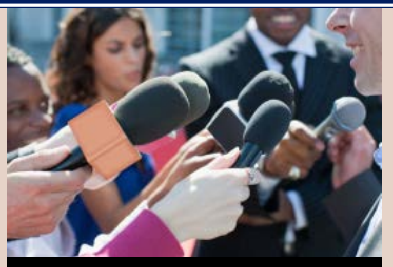
Farmworkers in the News

Track 2 is designed for attorneys with a basic knowledge of AWPA, FLSA, and H-2A law. Day One will focus on AWPA and FLSA, and Day Two will focus on the H-2A program. Advocates may attend one or both days of the advanced track training. Track 2 will help advocates who have mastered these basic farmworker law principles develop strategies for using them to meaningfully represent farmworkers whose rights have been violated. Participants will devise strategies for addressing common problems faced by both domestic and H-2A farmworkers, both through litigation and alternative means. Advocates will consider the benefits and limitations of various litigation approaches and examine important strategic issues arising in farmworker cases. Because there rarely are single right answers for most real-life situations, Track 2 will be conducted in a discussion style format.