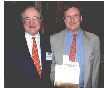
Harry M. Reasoner and J. Hampton Skelton